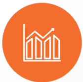
Linear Line of Sight™